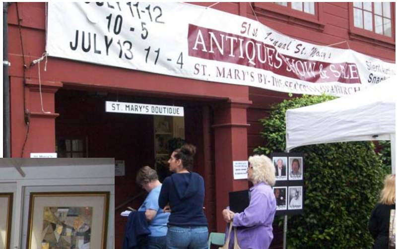
Shoppers lined up early for great buys in St. Mary's Thrift Shop during the 2008 Antiques & Collectibles Show & Sale.

Donate your Treasures to the St. Mary's Thrift Shop